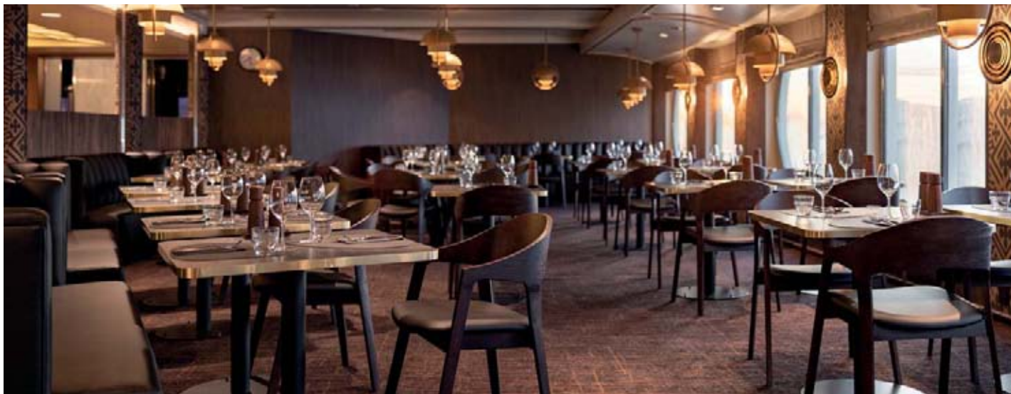
CLOCKWISE FROM TOP: ©SCHIBSTED, ©ESPEN MILLS, ©ESPEN MILLS