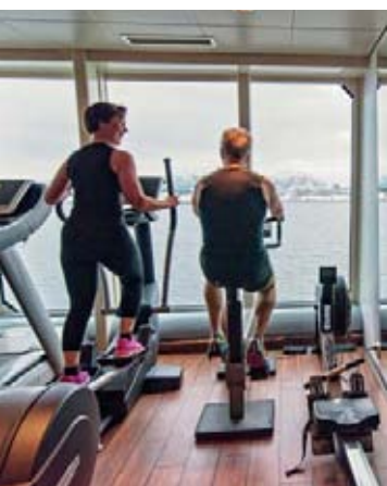
TOP: ©ESPEN MILLS, BOTTOM: ©AURTYANE CONCELLON

Life at sea aboard your ship, MS Trollfjord, is a marriage of modern comforts and age-old maritime ambience.