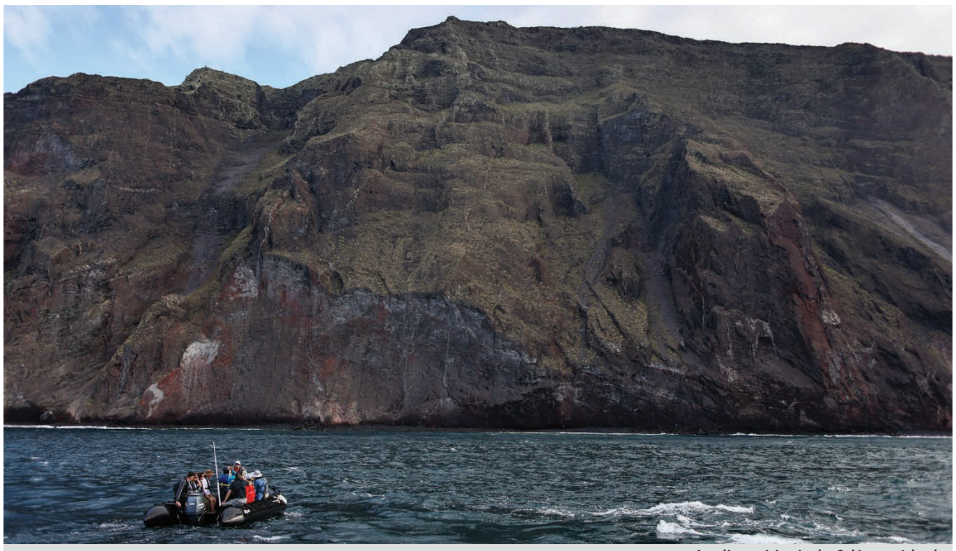
A zodiac cruising in the Galápagos Islands.