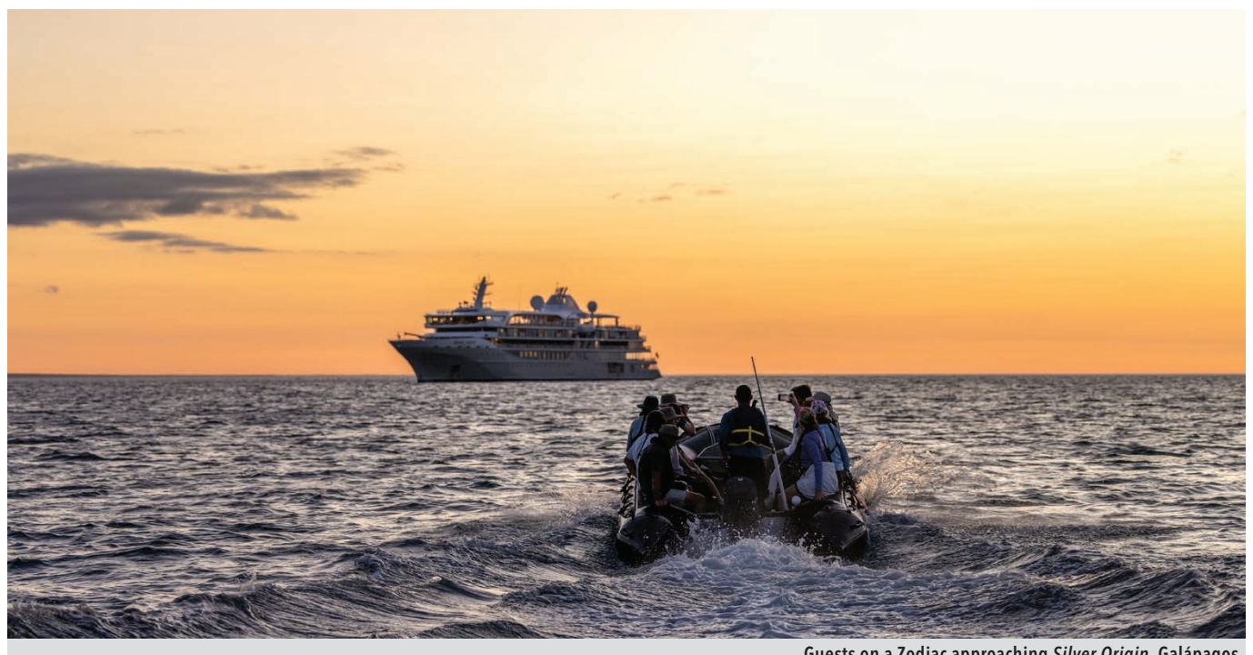
Guests on a Zodiac approaching Silver Origin, Galápagos

After each day's adventures, return to the comfort of your Silversea ship to share stories and reflect on your once-in-alifetime experiences.